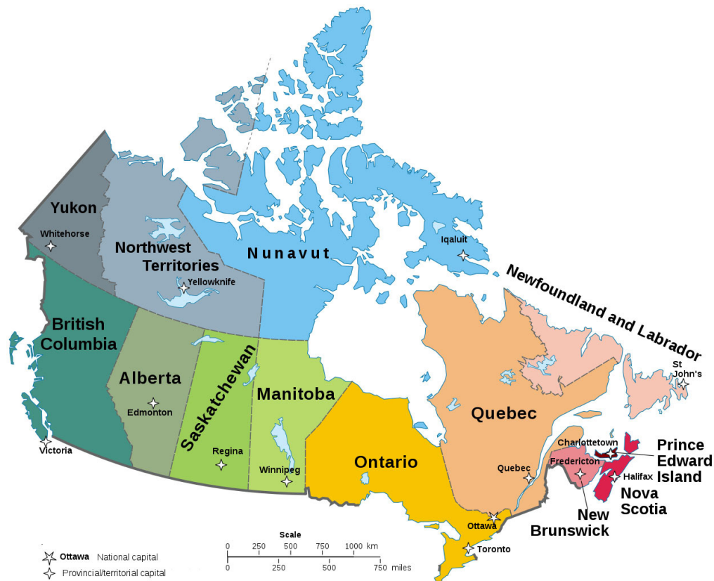
Political map of Canada (modified)

Canada is composed of 10 provinces and three territories that are divided into five regions: