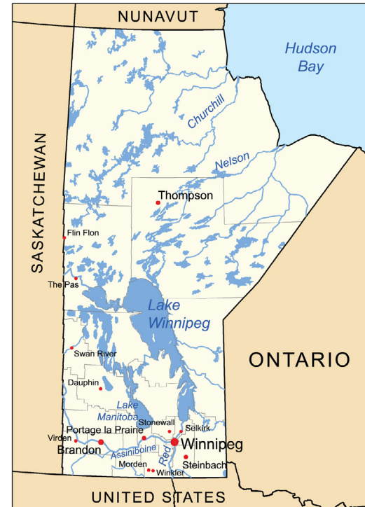
Manitoba general map by Kmusser from Wikimedia Commons. CC-BY-SA

This diverse province is located in heart of the country bordered by Saskatchewan to the west, Ontario to the east, Nunavut Territory to the North, and the US states of North Dakota, and Minnesota to the south. It has a varied landscape of lakes and rivers, forests, and prairies that covers 649,950 square kilometres. That's twice the size of the United Kingdom!