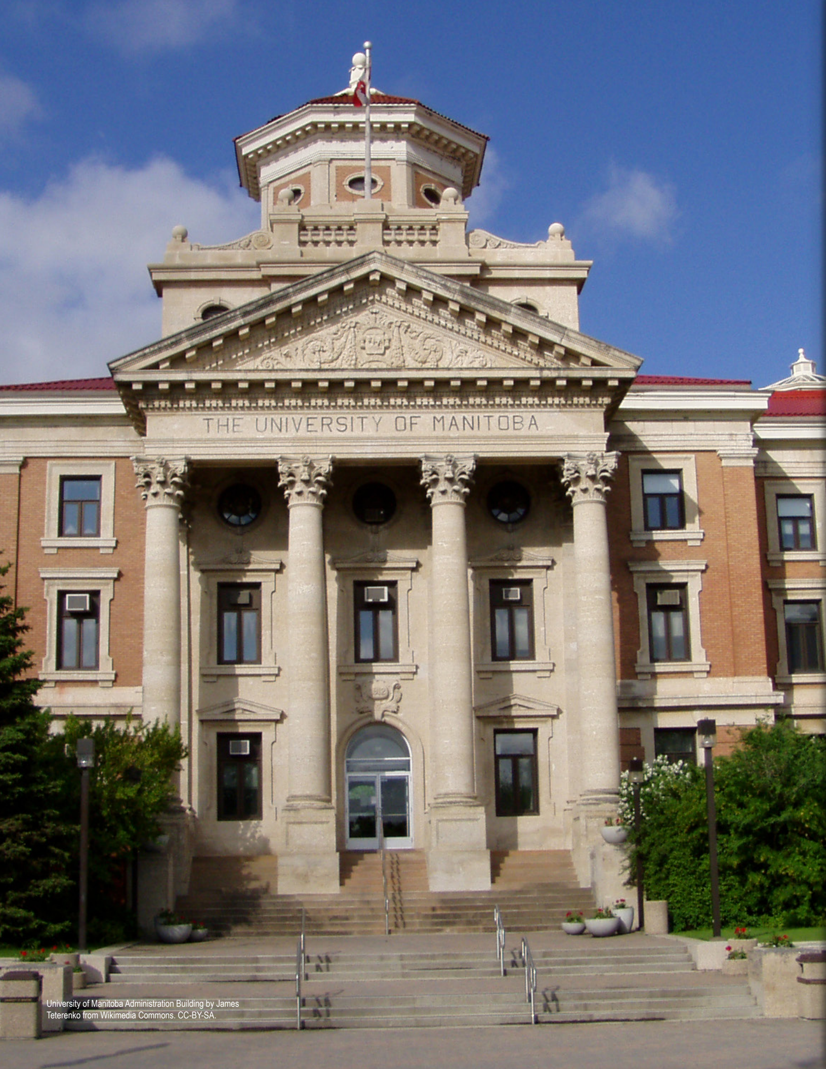
University of Manitoba Administration Building