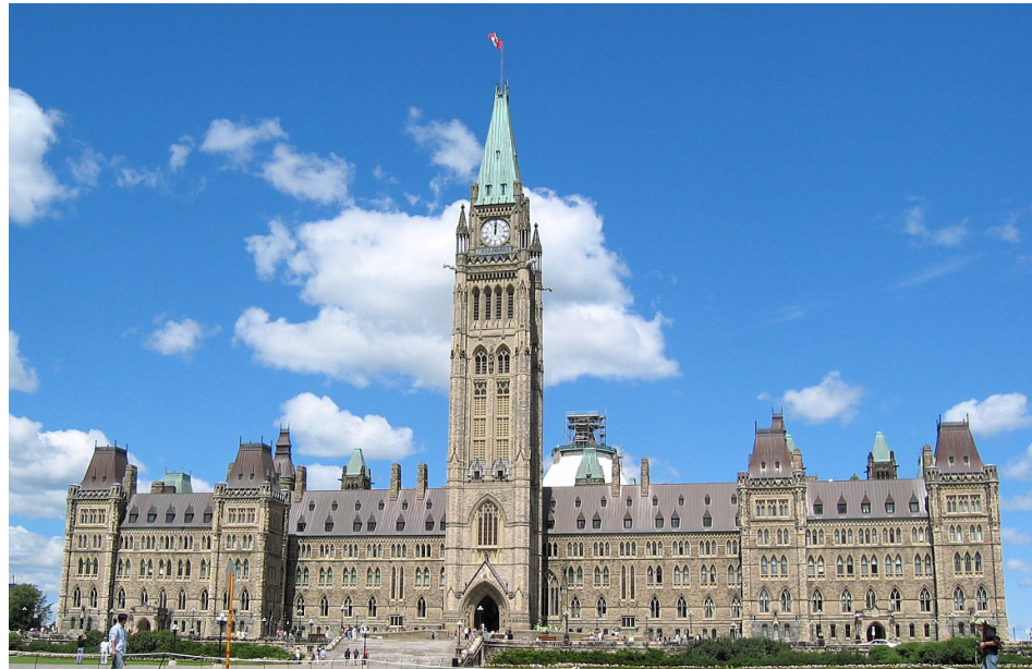
Parliament - Ottawa

Canada is proud of upholding the oldest continuous constitutional tradition in the world. Its form of government is a constitutional monarchy where the reigning British monarch (His Majesty King Charles III) is the head of state, while the Prime Minister is the head of government. The King does not directly rule. He is represented by the governor general at the federal level, and