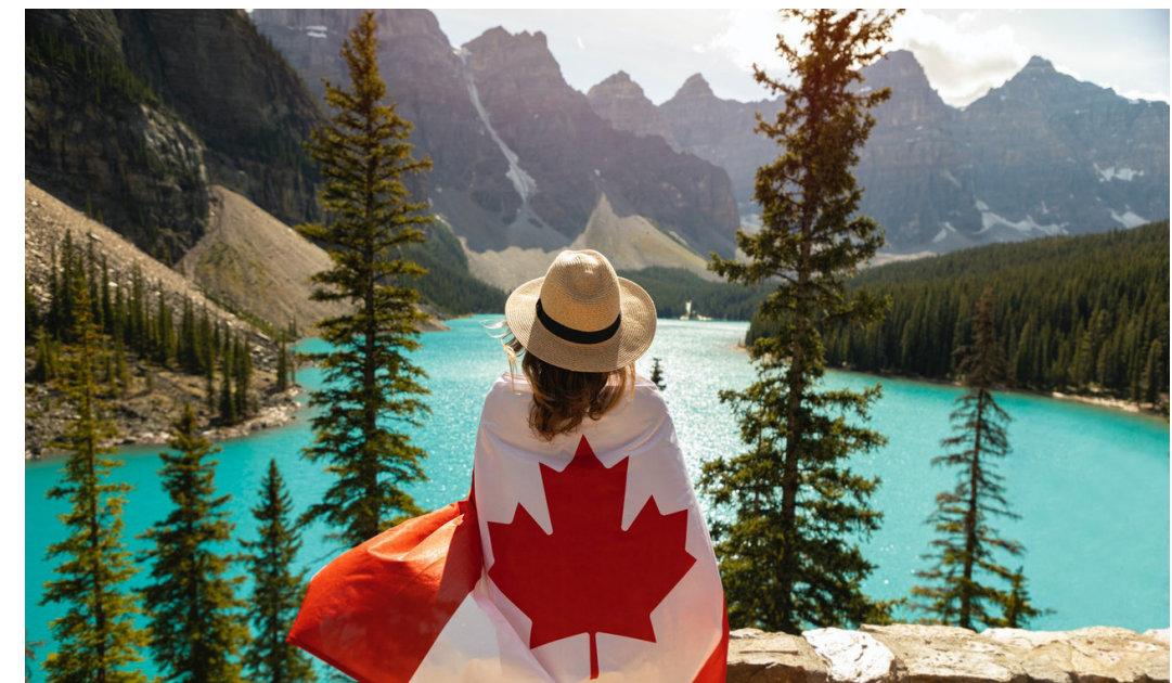
Woman draped in flag of Canada

Aside from majestic scenery, maple syrup, and hockey, the country is known for its diversity and most especially for its kind and welcoming people.