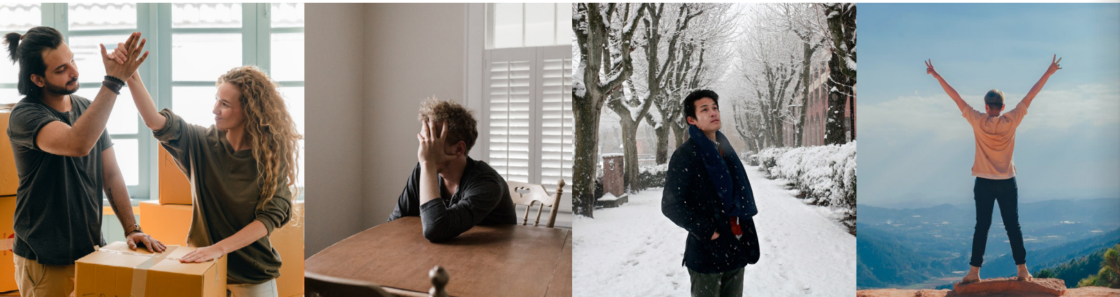
Image 1 by Ketut Subiyanto, Image 2 by Andrew Neel, and Image 4 by Min An, all from Pexels. Free to use. Image 3 by bomhehe100 from Pixabay. CCO.