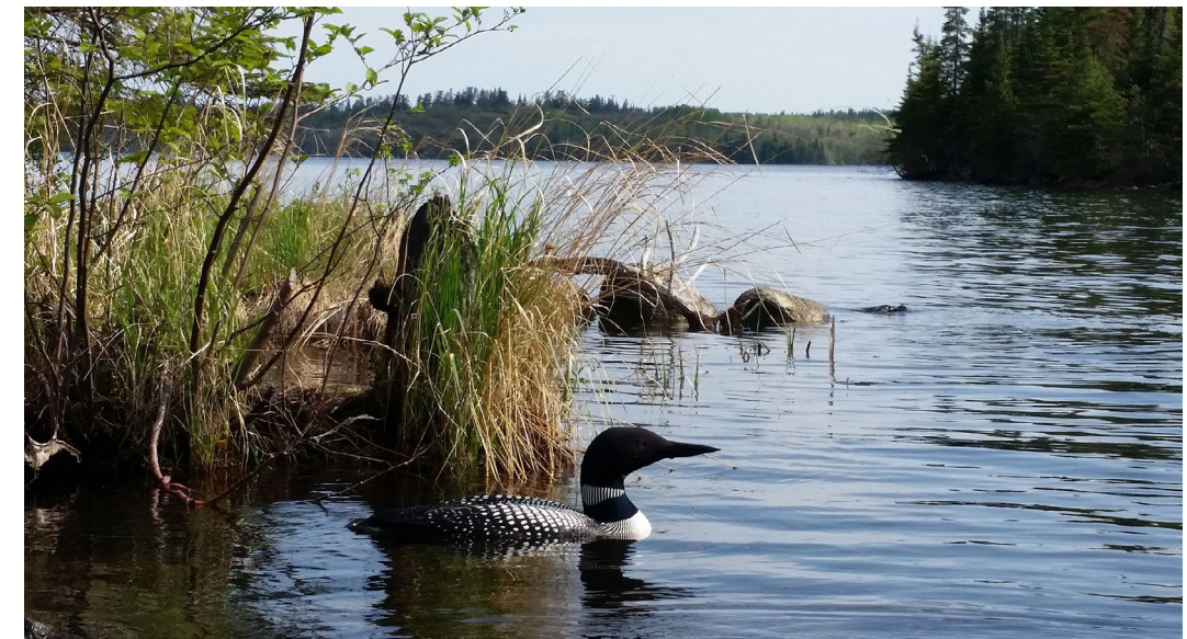
Canada loon at Falcon Lake, Manitoba

This land spreads over parts of the traditional territories of the Assiniboine, Dakota, Cree, Dene, Anishinaabeg, and Oji-Cree peoples, and on the homeland of the Métis nation. The province's name, "Manitoba" was derived from "Man-into-wahpaow", which is Cree for the narrows of the Great Spirit .